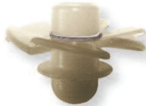
Zementrestriktor Cement Restrictor